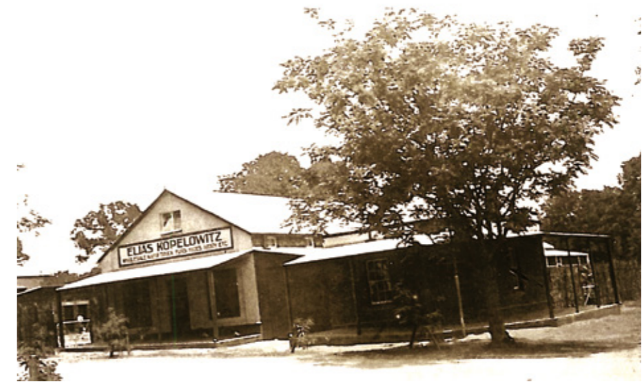
Elias Kopelowitz Hardware Store